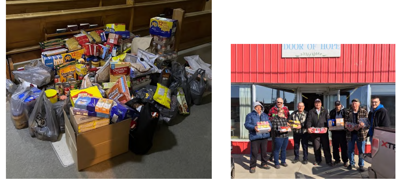
Meadow Lake Assembly 2792 and Council 5259 Knights Food Drive for the Door of Hope Food Bank