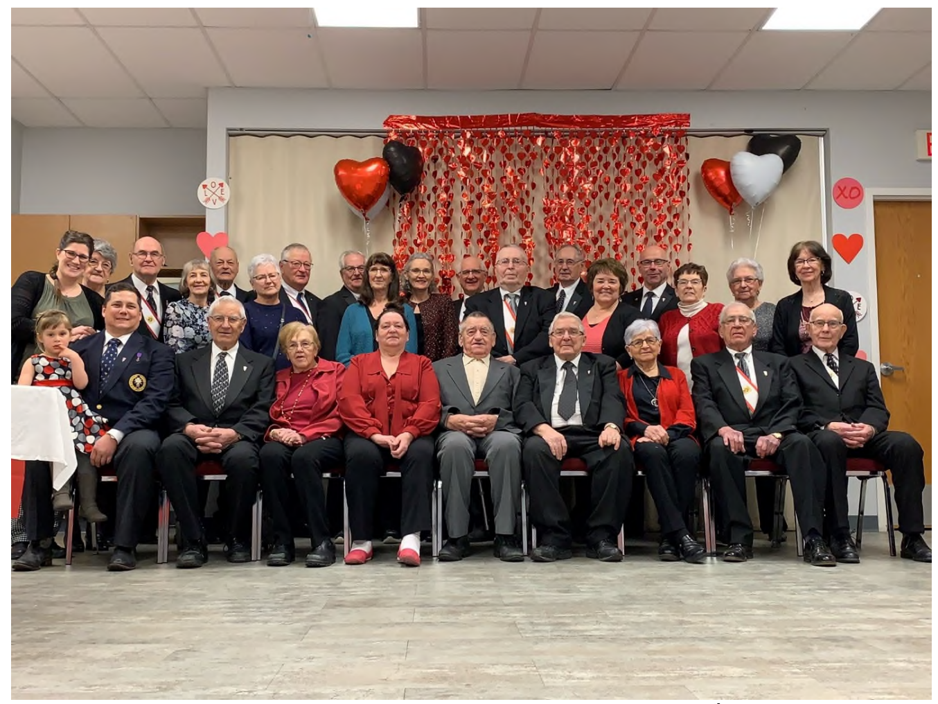
Abbot Severin Dertkin Assembly #2166 Valentines Get-Together on Feb. 14<sup>th</sup>, 2024