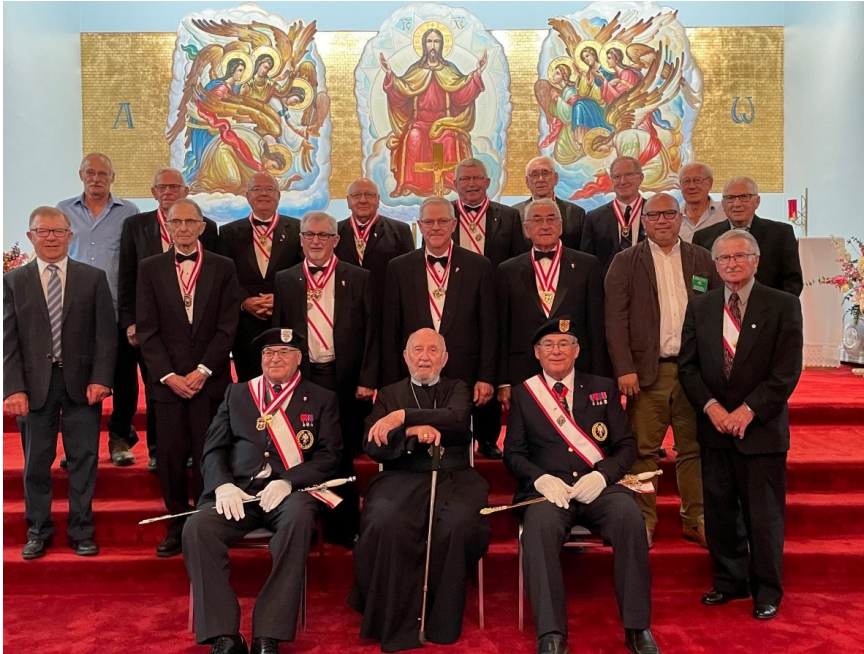
Assembly Officers and Sir Knights from Brother Stanislaus Assembly #1286- Yorkton and Father Michael J. McGivney Assembly #1904- Foam Lake