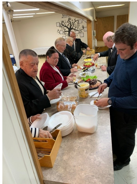
Fraternity and socializing after the Installation of assembly officers

Note- A Fourth Degree Exemplification of new fourth-degree members will be hosted by Abbot Severin Gertken Assembly #2166 in Humboldt on Sunday, Nov. 13 th . Please review the poster in this newsletter and support the assembly by bringing some candidates to the event.