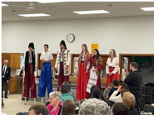
Entertainment- stilt walkers