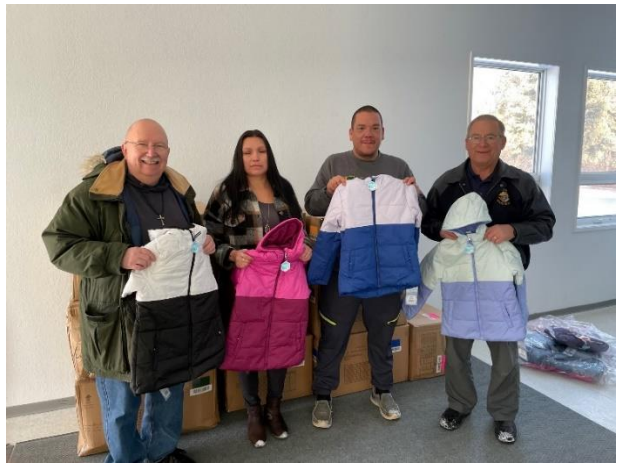
Coats for Kids for First Nations Communities