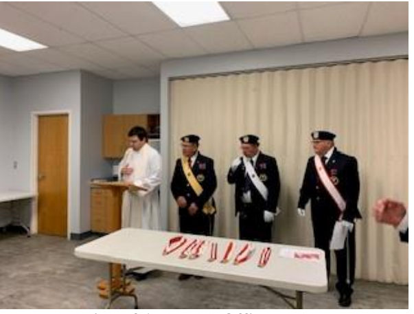
Installation of Assembly Officers- Humboldt