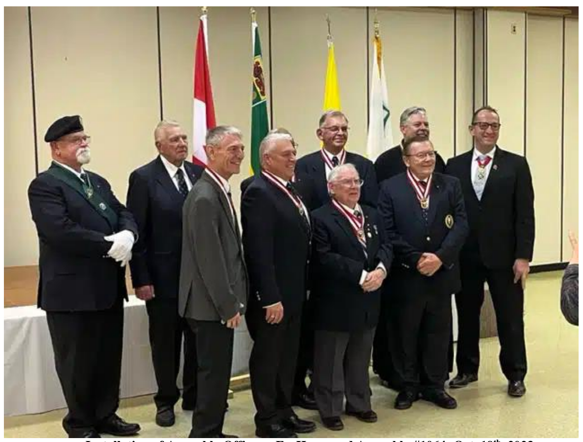
Installation of Assembly Officers- Fr. Hugonard Assembly #1064- Oct. 19th, 2023