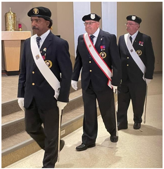
4<sup>th</sup> Degree Honor Guard