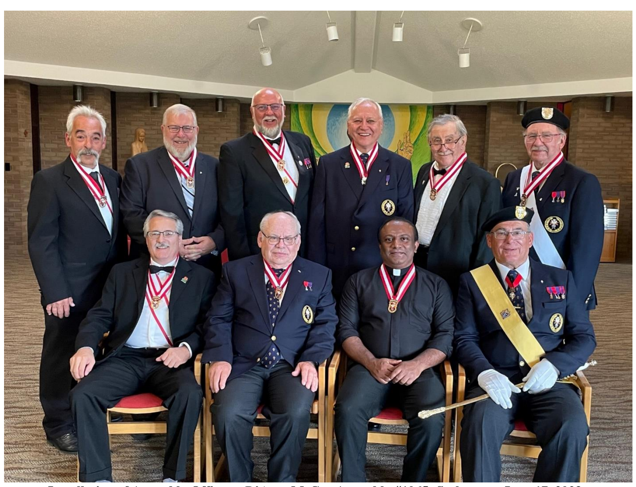
Installation of Assembly Officers- D'Arcy McGee Assembly #1065- Saskatoon- June 17, 2023