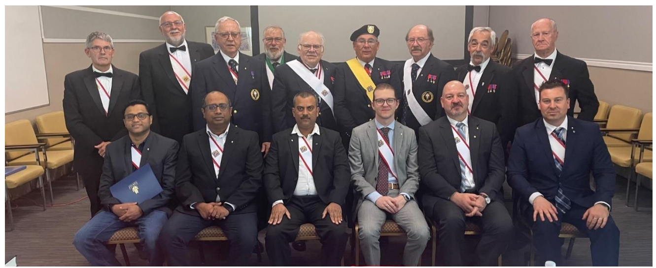
Fourth Degree Exemplification hosted by D'Arcy McGee Assembly #1064- May 5, 2023 Back Row- Exemplification Team, Front Row- 6 New Sir Knights for Assembly 1065