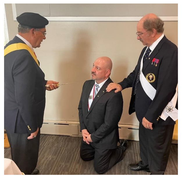
Receiving the Stroke of Knighthood