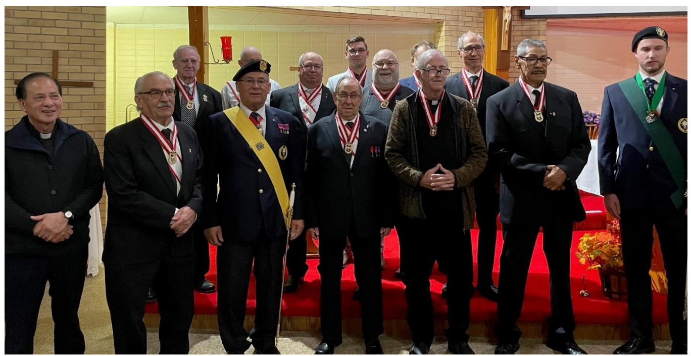
Installation of Assembly Officers- North Battleford- October 23<sup>rd</sup>, 2023