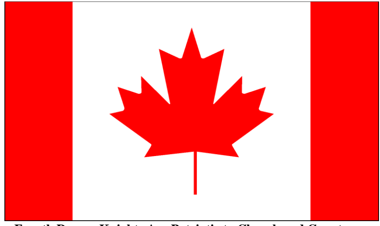
Fourth Degree Knights Are Patriotic to Church and Country.